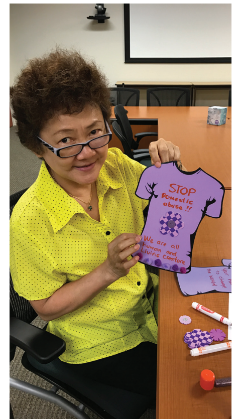
CLINIC has trained nonprofits to help immigrant victims of domestic violence for more than a decade. Above, a staff member shares a message of support.