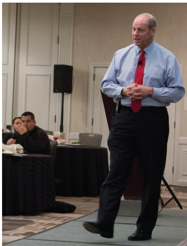
The Committee on Immigration Reform Implementation, co-chaired by CLINIC, hosted the second Ready America conference so that service providers, advocates and legal experts could learn and prepare. Above, participants ask questions in workshops and León Rodríguez, Director of U.S. Citizenship and Immigration Services, speaks at the keynote session.