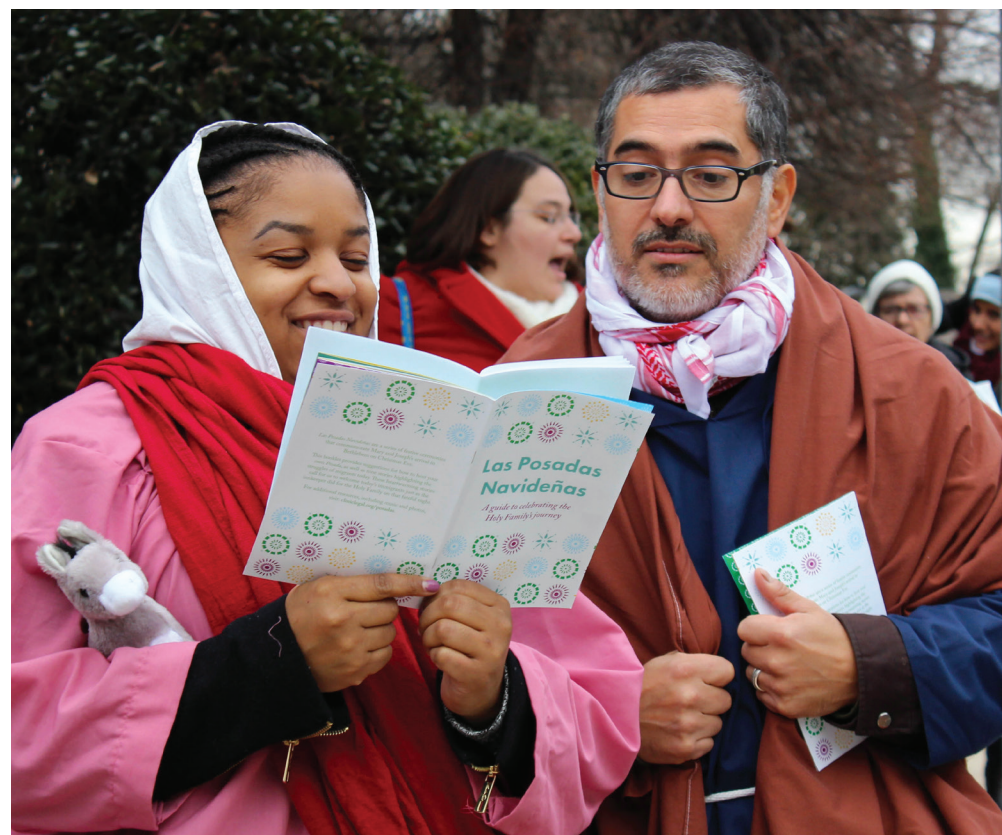
CLINIC celebrated our first Las Posada Navideñas in Silver Spring, featuring our new guide that explains the 400-year-old Latin American tradition, teaches how to host one and provides stories of immigrants to read aloud. Find the guide at cliniclegal.org/posadas . Above, staff members dressed as Mary and Joseph lead the procession.