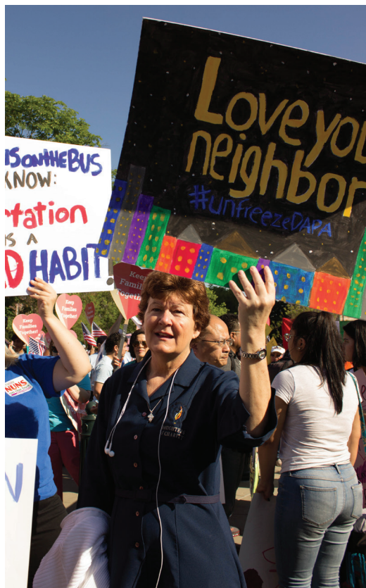
CLINIC staff demonstrated outside the Supreme Court during the United States v. Texas deliberations. Above, a sister in the crowd makes the Catholic case for DAPA.